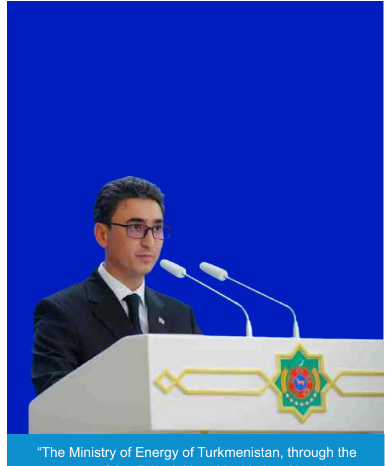
"The Ministry of Energy of Turkmenistan, through the successful policies initiated by National Leader Gurbanguly Berdimuhamedov and continued by President Serdar Berdimuhamedov, has significantly strengthened its infrastructure. Today, the industry operates 12 power plants with a total installed capacity of 7,000 MW, ensuring reliable electricity supply domestically and growing exports to neighboring countries."